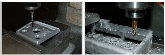
Precision Machining to ensure consistent quality is achieved for every unit produced.

Call us to discuss your splice detection applications and to learn more about the industries most diverse line of machine vision web inspection related products.